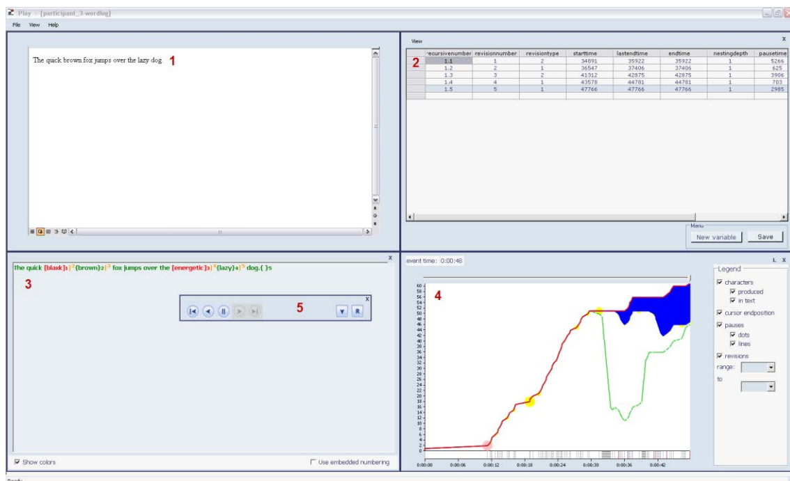
Figure 2. Example of replay full writing process and revisions.

The revision data is represented in an Excel-like matrix, showing the main characteristics of each revision (revision number, revision type, recursiveness, start time revision, end time revision, nesting depth, pause time before revision, number of characters before revision, number of characters after revision). Besides these fixed variables, researchers can add new variables: e.g., type of error, linguistic category of error, grammatical error, etc. All variables – given and added – can be changed and saved. This creates great flexibility for researchers to analyze the data according to their research question.